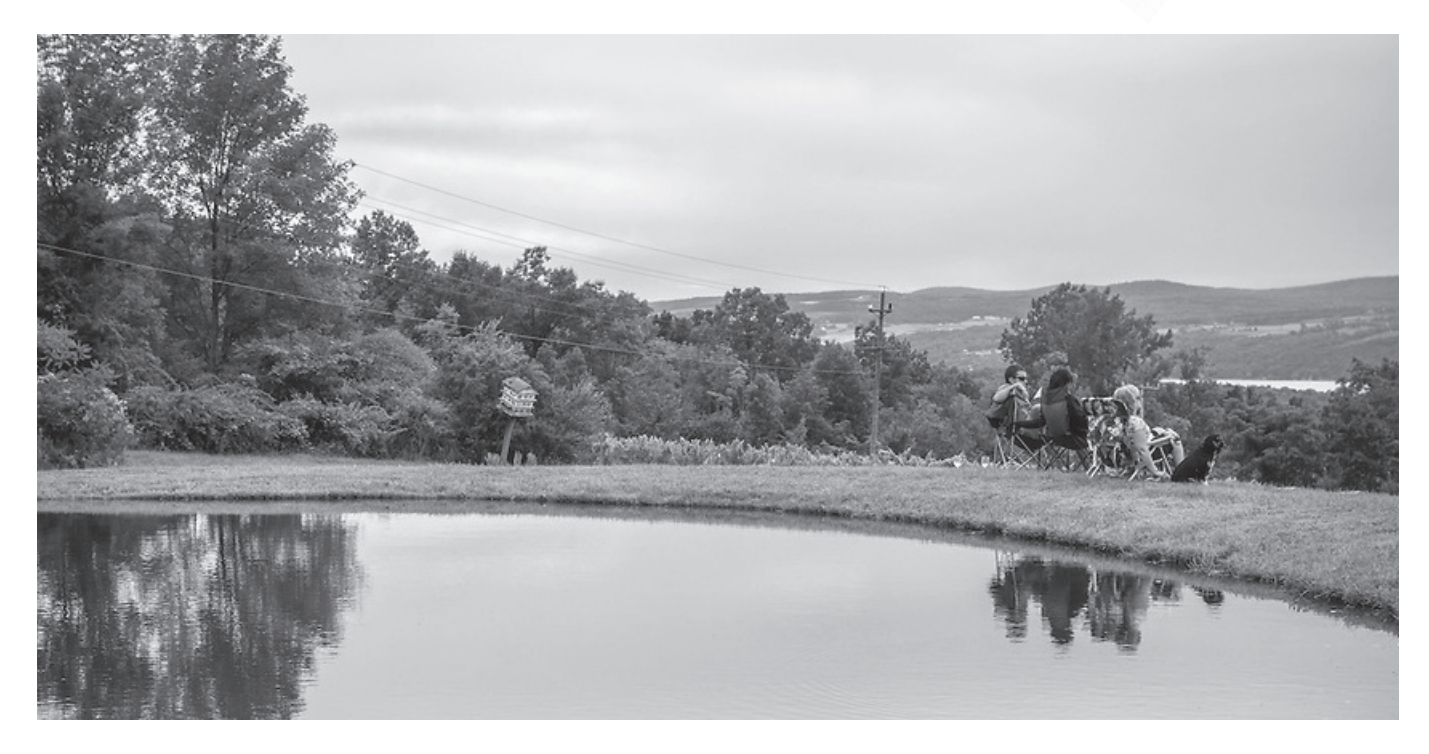
"Here's to the corkscrew—a useful key to unlock the storehouse of wit, the treasure of laughter, the front door of fellowship, and the gate of pleasant folly."